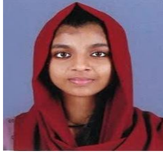
Nofa P S Marks: 92/100